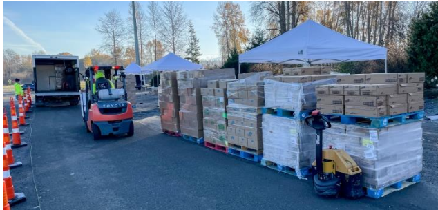
The Sequim Food Bank delivered 1300 boxes of food for distribution on 17 November 2023.

The holiday season can be especially stressful for some of Sequim's most needy families, who do not have the resources to purchase necessary food items. In recognition of this need, the Sequim Food Bank organizes a major food distribution event and, because of the scope and scale of this effort, must seek assistance from the community to make it happen. CERT is able to provide willing volunteers to guide the traffic through the distribution site and, this November, loaded 1062 boxes of food into the waiting vehicles. As a result, many Sequim families will be able to share in the spirit of the holiday season with thankfulness for those who gave of their time and resources to bring this community event to fruition.