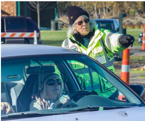
CERT Personnel guided the drivers to the food pick-up area.

The holiday season can be especially stressful for some of Sequim's most needy families, who do not have the resources to purchase necessary food items. In recognition of this need, the Sequim Food Bank organizes a major food distribution event and, because of the scope and scale of this effort, must seek assistance from the community to make it happen. CERT is able to provide willing volunteers to guide the traffic through the distribution site and, this November, loaded 1062 boxes of food into the waiting vehicles. As a result, many Sequim families will be able to share in the spirit of the holiday season with thankfulness for those who gave of their time and resources to bring this community event to fruition.