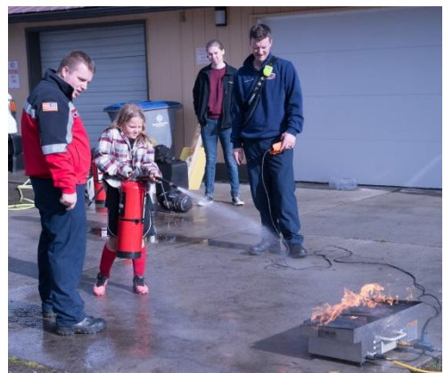
CCFD3 provided fun things for the kids to try, like extinguishing a real fire, and watching how a fire can spread through a dollhouse.