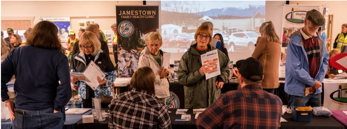
About 35 public service agencies and organizations chose to participate and make themselves known to the hundreds of visitors who stopped at their colorful display tables to learn about their community services.