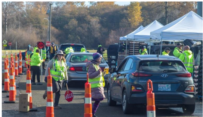
Other volunteers were on site to assist in the food distribution effort, including Rotary and Lions club members.