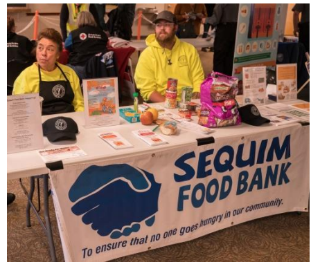
The Sequim Food Bank often works with the CERT program to distribute food.