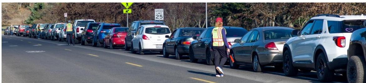
Hundreds of vehicles were guided through the food distribution line. Blake Avenue was bumper to bumper.