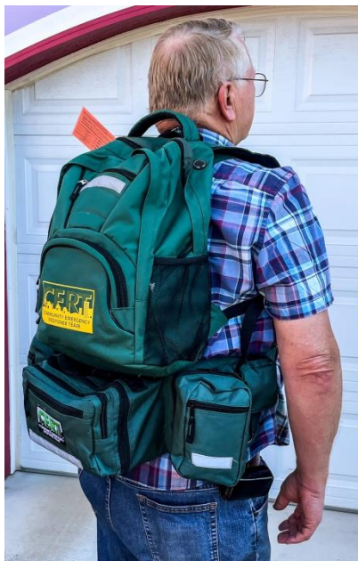
The Squad Med Kit is worn just beneath the backpack.