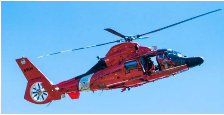
Coast Guard fly-by “hangs ten” out the door.